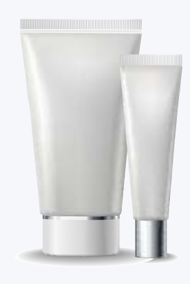
Personal Care Packaging 27%