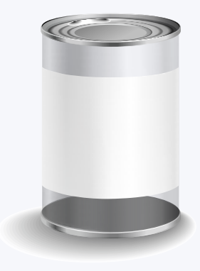
Processed Food Packaging 48%