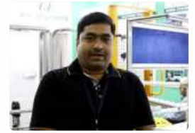
S K Shukla A V Engineers