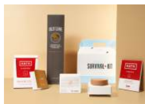
Folding carton packaging