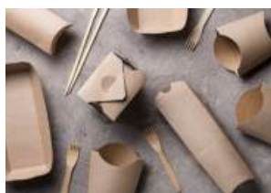
Paper packaging market