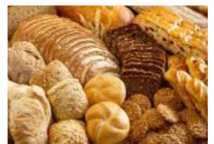
Indian bakery market