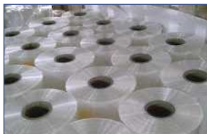
Packaging Raw material

Print Fair will showcase generation next technologies from solution providers across various categories like pre-press, on-press and post press segments. The Show will host exhibitors showcasing solutions in Flexo & Gravure printing, Digital presses, Offset presses, Wide format Printers.