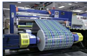
Flexible Packaging Converting Machines