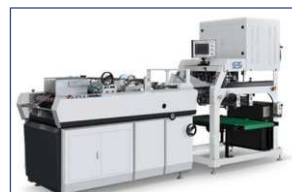
Corrugated Box Making Machine