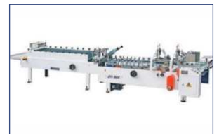
Carton Folder Gluers Machines