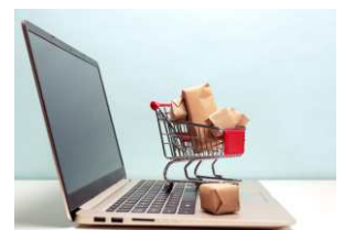
E-Commerce / Retail