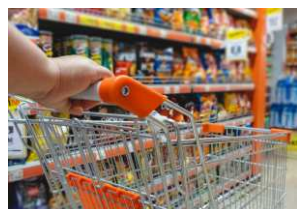
FMCG / FMCD