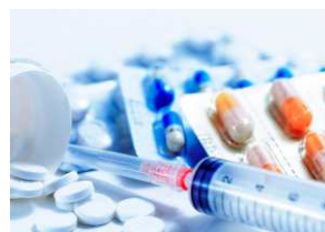
Healthcare / Pharma