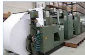
Paper Converting Machines