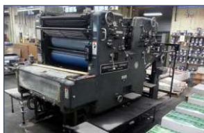
Rigid Box Making Machines