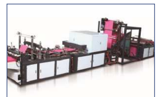
Non-woven Bag Machine